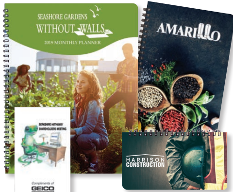
Custom Four Color Covers