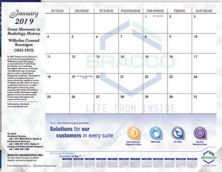
Custom Desk Pads

Displayed product images may represent oversized imprints, multi-colored imprints, and/or custom title imprints; these may incur additional charges.