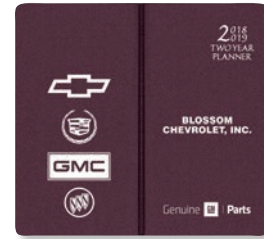
Imprint Front & Back Cover