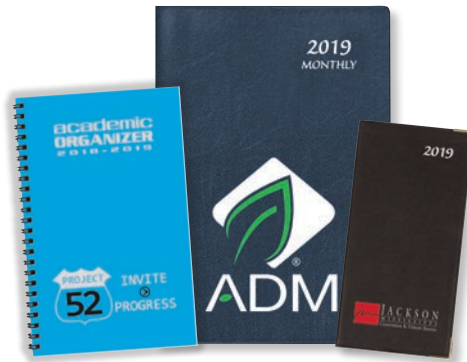
Multi-Color Custom Imprints